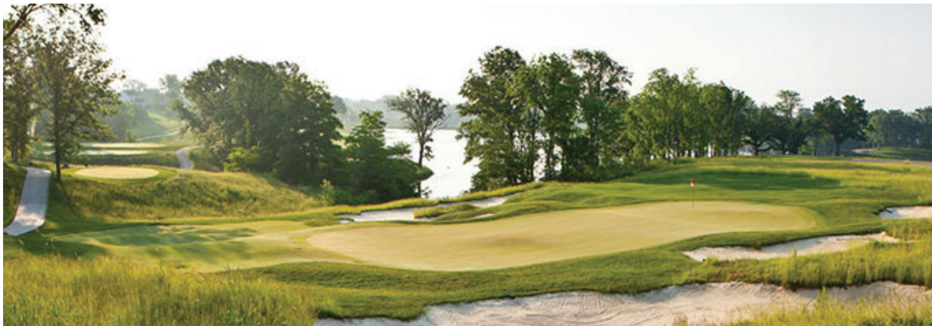
Fyre Lake Golf Club

Quad Cities layout gets new owner, and he has a plan