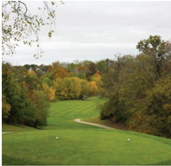
Hawthorn Ridge Golf Course

With a weekday rate of $45 and weekend rate of $65, his main in-town competition is TPC Deere Run, home of the John Deere Classic. The local municipal courses are less expensive, but he may get a few players from the several private clubs in the area, including Davenport – site of this week’s Iowa Amateur – Crow Valley, Oakwood, Pinnacle and Short Hills.