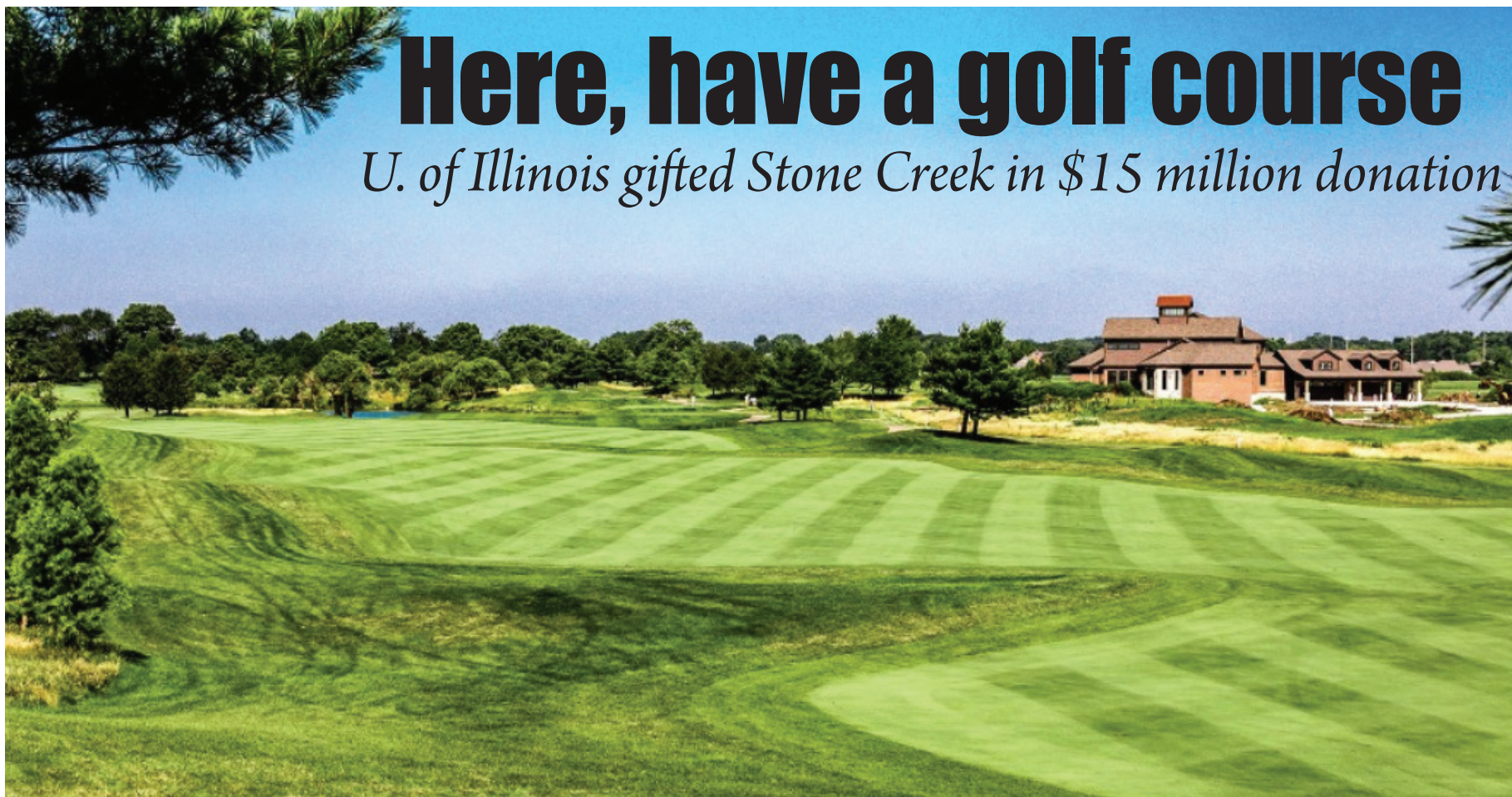
Stone Creek Golf Club

NEW LIFE FOR URBANA LAYOUT Stone Creek did not open this year, but Illinois plans to have it up and running again in 2021.